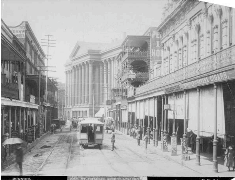
Fig. 4. St. Charles Street. St. Charles Street provided streetcar service through the business district. It was not uncommon for narrow roads to boast parallel sets of track. Track installation frequently came with hard pavement or improved drainage gutters. Wealthier residential and commercial districts tended to be well serviced.