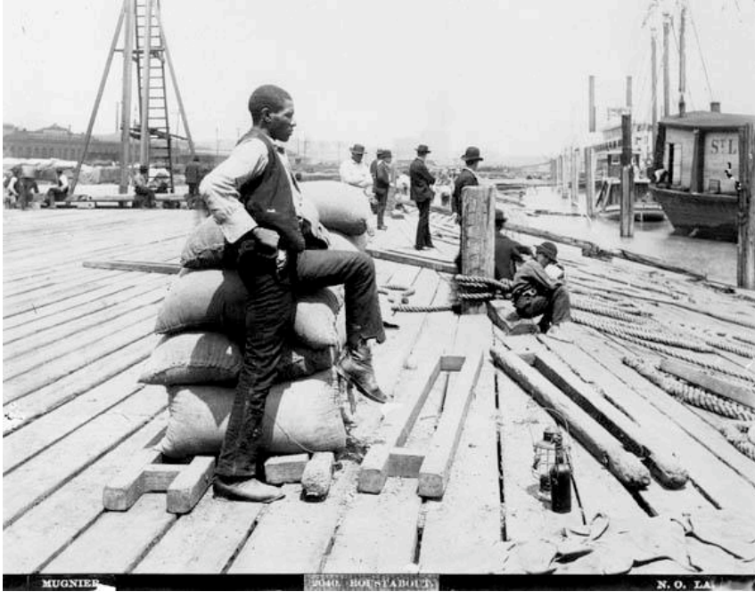
Fig. 5. Roustabout on a Quay. Dock work was an area where Freedmen could hope to compete with poor whites for employment.