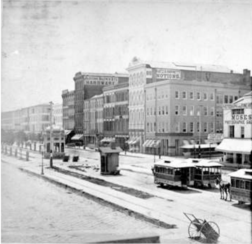
Fig. 3. Canal Street. Canal Street was a main thoroughfare for all kinds of transportation. It was also the traditional dividing line between the American and Creole parts of town. Ca 1865-1925