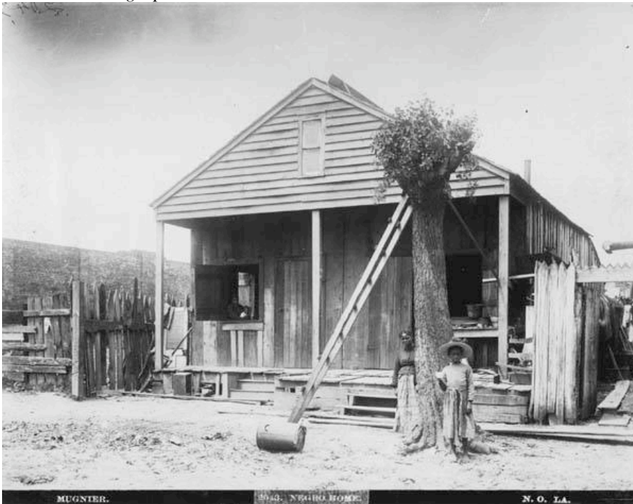
Fig. 8. Black Home. Conditions for many freedmen were unhealthy, remaining out of sight and out of mind on the edge of the swamp. Others lived in similarly deplorable conditions in overcrowded tenements.