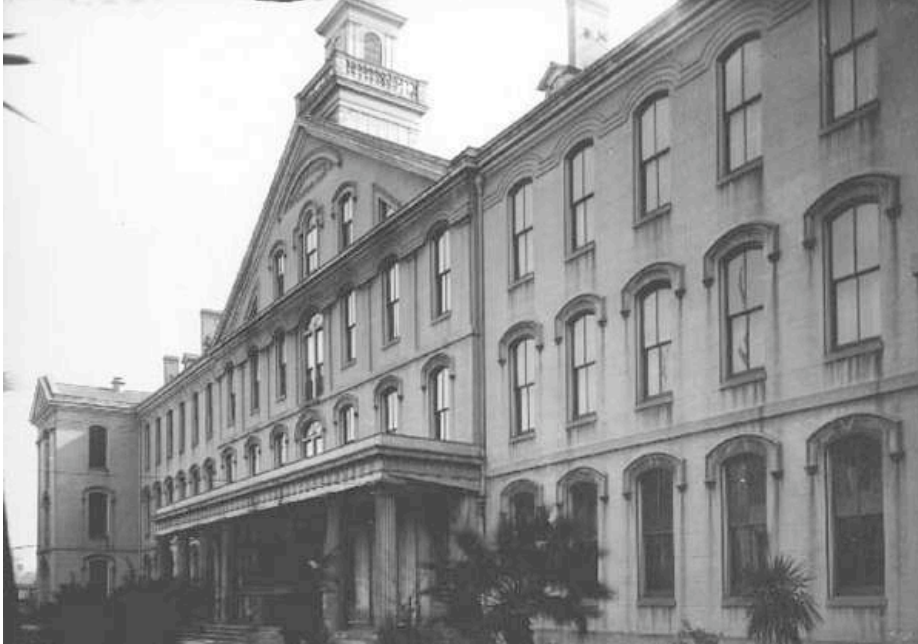
Fig. 7. Charity Hospital. New Orleans Charity Hospital was located on Tulane Avenue. It was operated by Catholic nuns, but heavily subsidized by city government and secular charities.